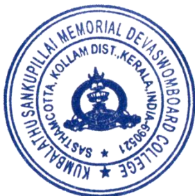
PRINCIPAL K.S.M.D.B COLLEGE SASTHAMCOTTA

Yoga Training is given to the students every year and this caters to their physical and mental wellbeing .