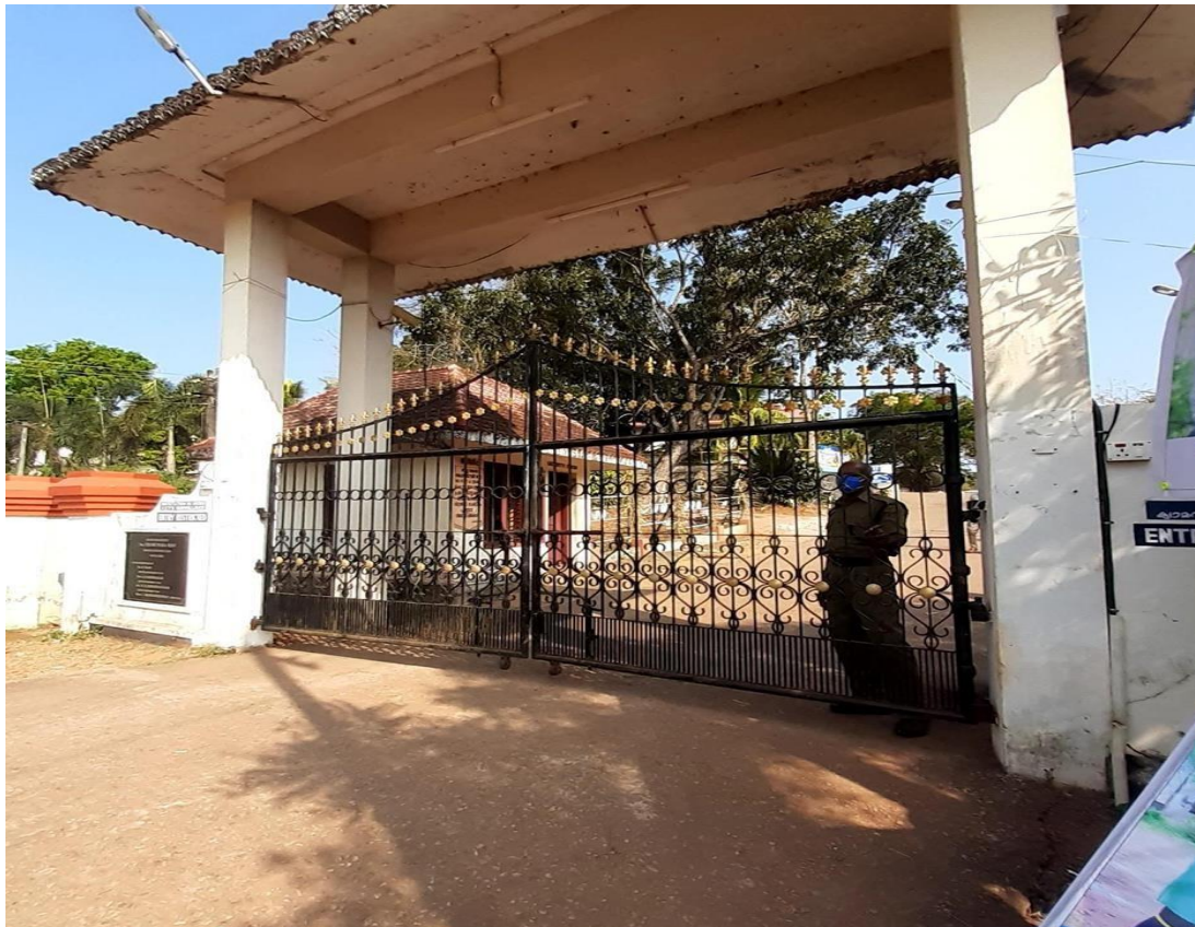
COMPOUND WALL AND MAIN GATE