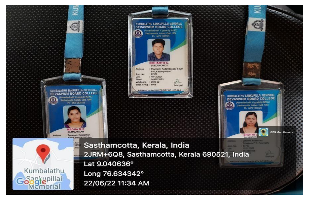
ID Card: It is mandatory for the staff members and students of the college to wear ID cards issued by the college.