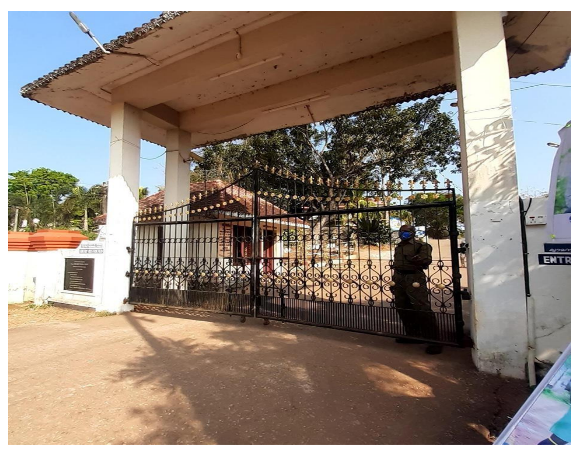
COMPOUND WALL AND MAIN GATE