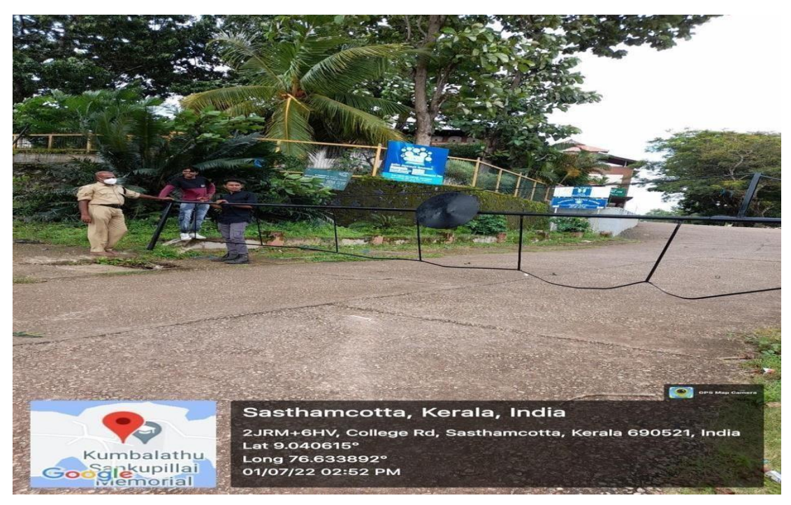
RESTRICTED ENTRY OF AUTOMOBILES AT THE MAIN GATE