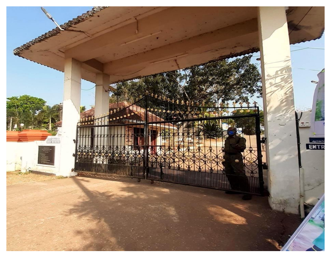
COMPOUND WALL AND MAIN GATE