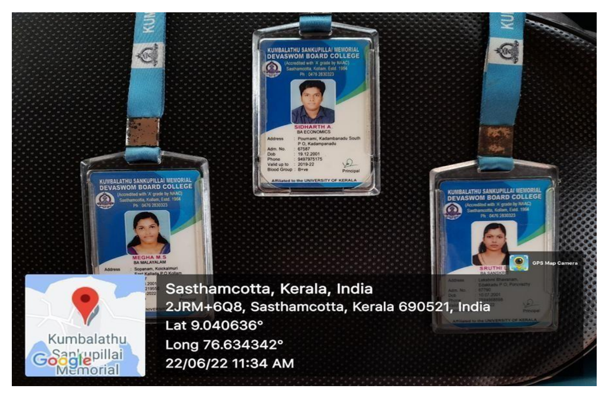
ID Card: It is mandatory for the staff members and students of the college to wear ID cards issued by the college.